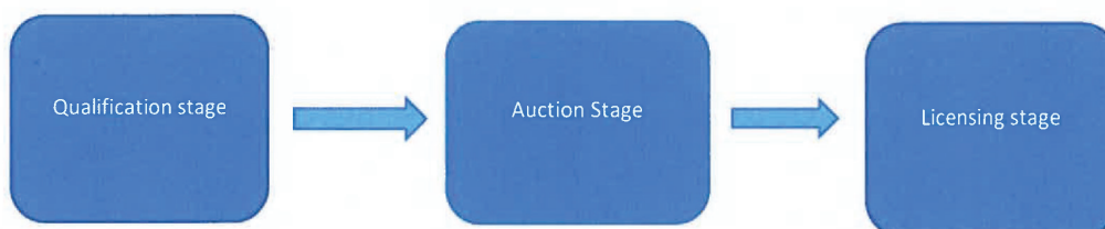
Diagram of award process of the Spectrum to the Industry