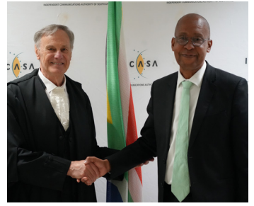
Swearing in of newly appointed Councillors