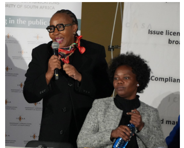
International Girls in ICT Day at Ivory Park Secondary School