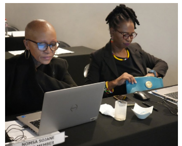
Community Sound Broadcasting Services Workshops