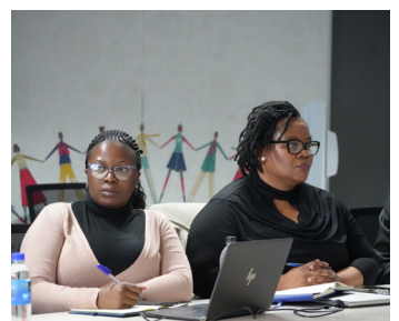
Benchmark study visit to ICASA by the Mozambique and Eswatini regulatory counterparts