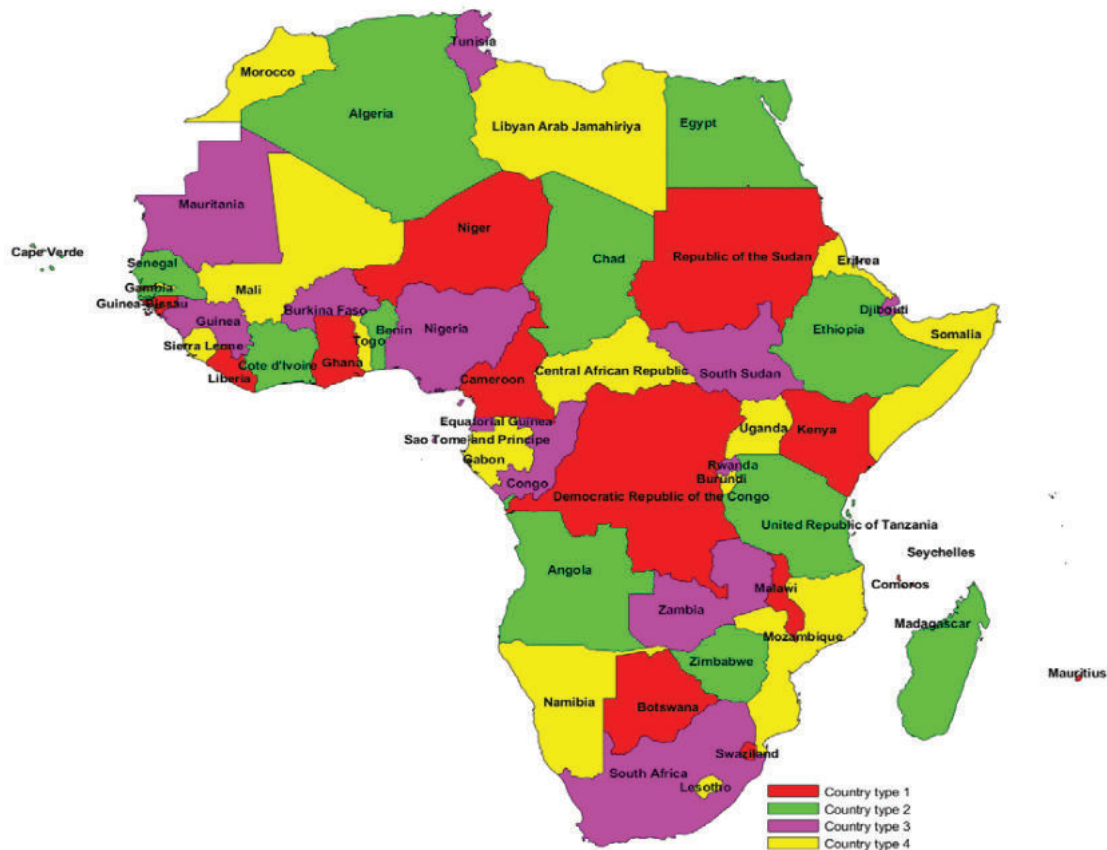
Figure 2: Country type map/PCI distribution map

/multilateral coordination agreements as necessary and may include further subdivision of the allocated codes in certain areas.