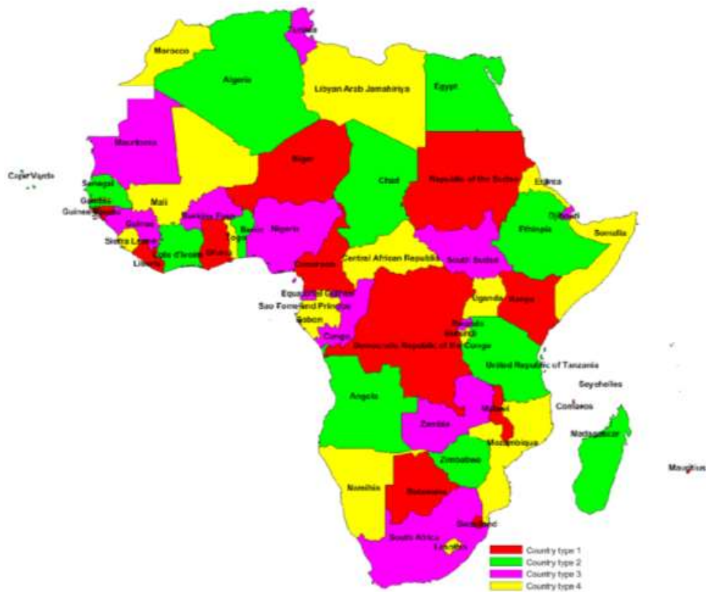
Figure 2: Country type map/PCI distribution map

For each type of country, the following tables and figure describe the sharing of the PCIs with its neighbouring countries, with the following conventions of writing: